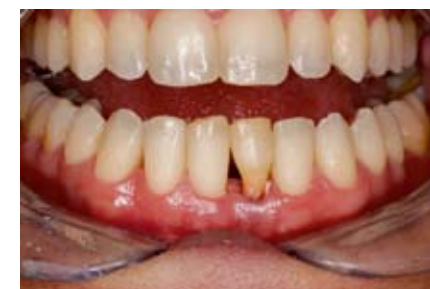
Fixation of the actual condition with composite before the extraction